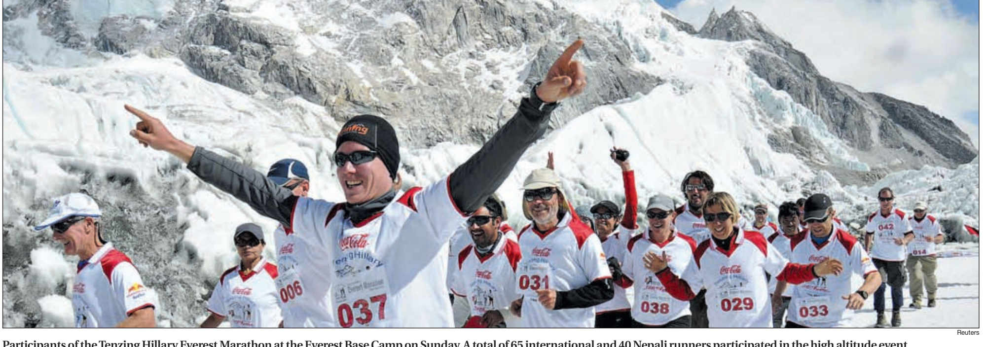
Participants of the Tenzing Hillary Everest Marathon at the Everest Base Camp on Sunday, A total of 65 international and 40 Nepali runners participated in the high altitude event.